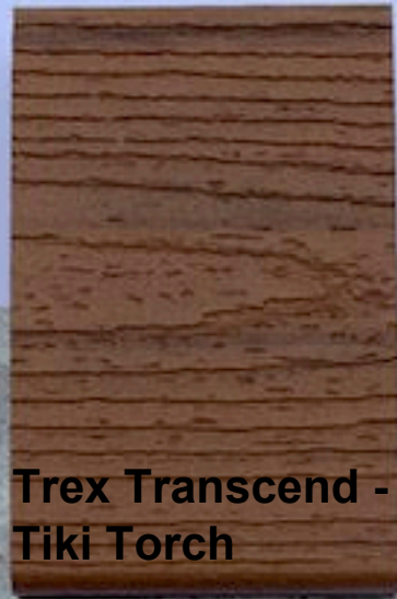
Trex Transcend - Tiki Torch