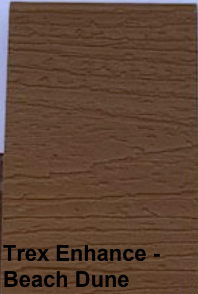
Trex Enhance - Beach Dune