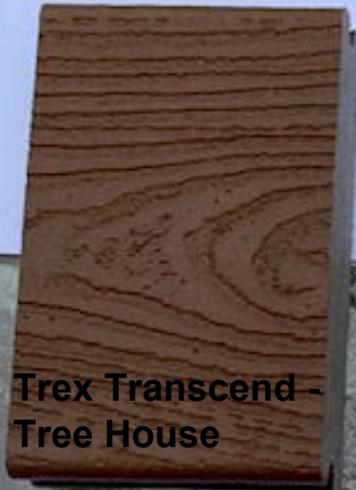
Trex Transcend - Tree House