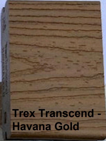
Trex Transcend - Havana Gold