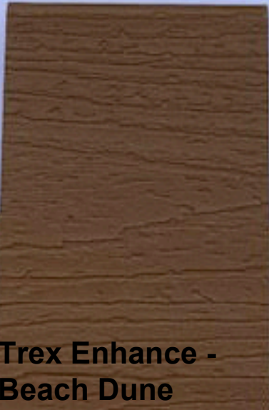
Trex Enhance - Beach Dune